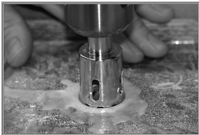
Figure 1. Example of diamond bit drilling hole in glass.

These bits can be used with a handheld drill or drill press. However, we recommend using a drill press whenever possible for greater control and precision (see Figure 1 ).